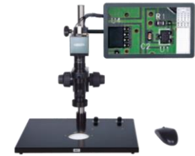
Digital Measuring Microscopes