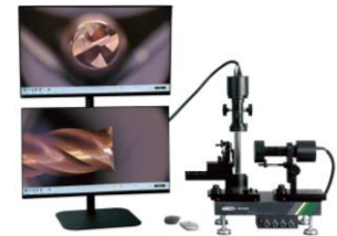
Dual-Display Cutting Tools Microscopes