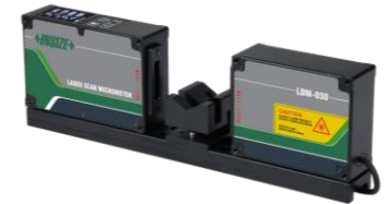
Laser Scan Micrometers