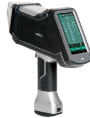
Handheld Libs Spectrometers