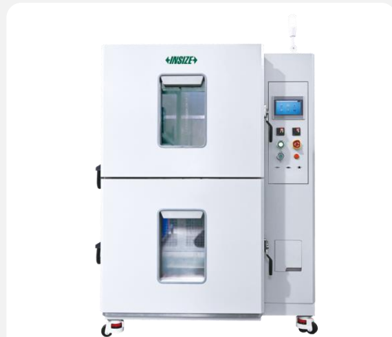
Thermal Shock Test Chambers