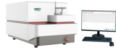
Spark Direct Reading Spectrometers