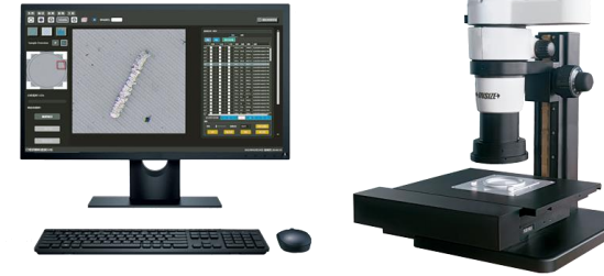
Automatic Cleanliness Analysis Systems