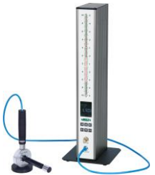
Air Gauges And Displays