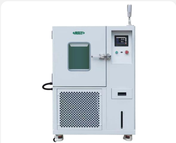
Temperature And Humidity Chambers