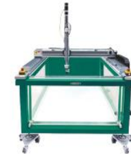
Ultrasonic Water Immersion Detection Systems