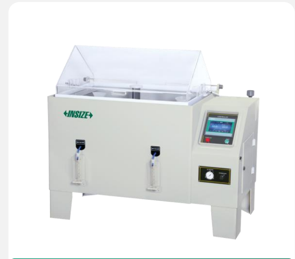
Salt Spray Test Chambers