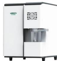
Carbon And Sulfur Analyzers