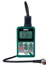
Ultrasonic Thickness Gauges